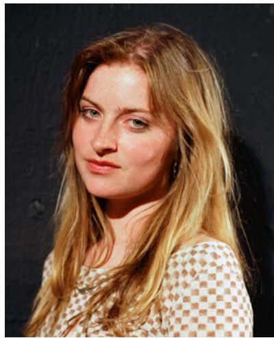
PEGGY NOONAN. Triple libra. Deranged but sweet. Midwestern but aware.